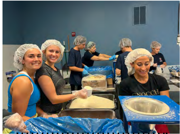
Feed My Starving Children