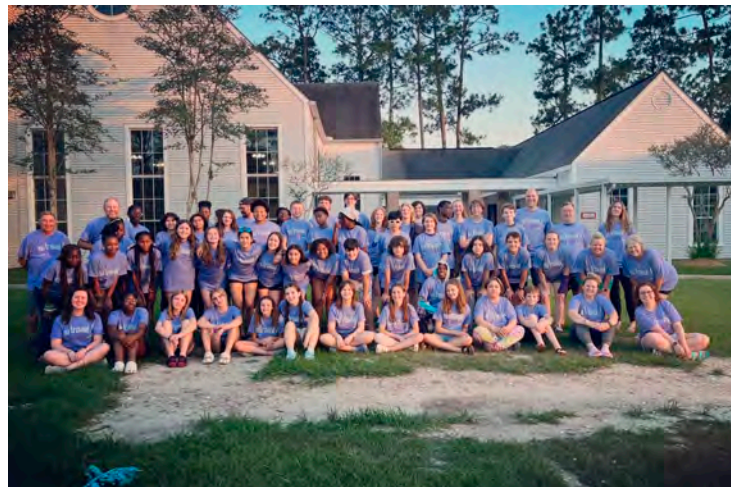
Slidell Mission Trip