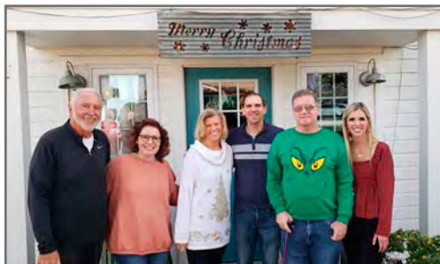
Staff Christmas 2023

The anticipated staff expenses, spanning from payroll taxes to ongoing education, are distributed across the budgeted categories mentioned earlier.