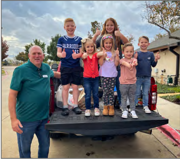
ACO Thanksgiving Food Collection