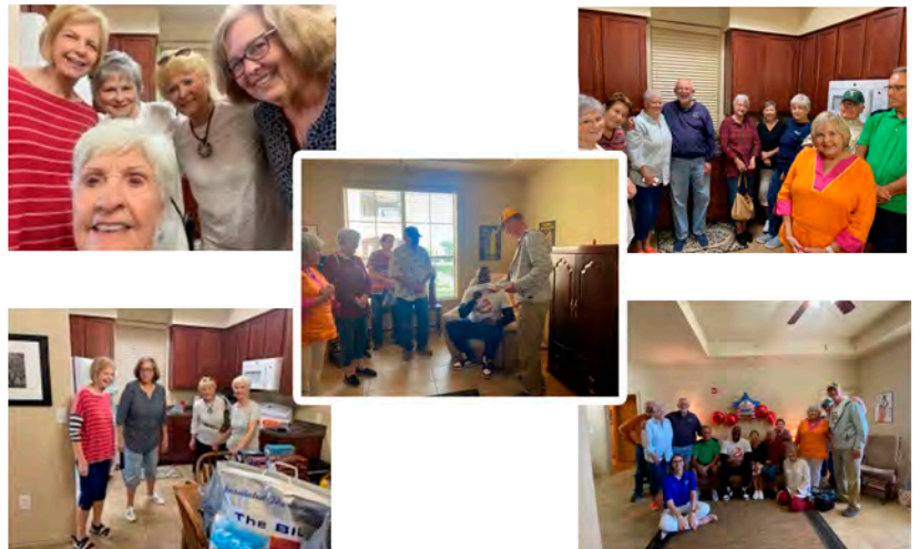
Samaritan Inn Apartment Dedication