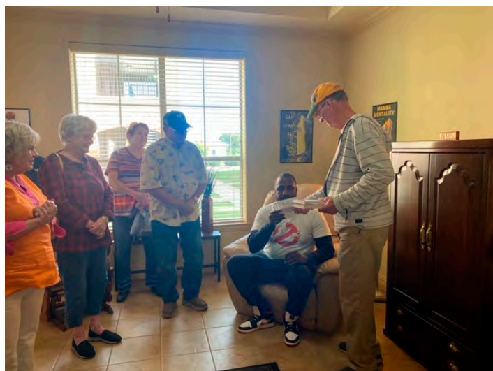
Samaritan Inn Apartment Dedication

Thank you so much for your giving hearts.