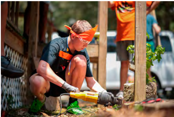
Student Mission Trip