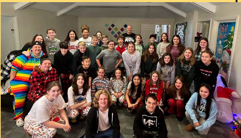
Creekwood Students participated in Pajama Sunday in December.